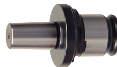
Drill Chuck Adapter